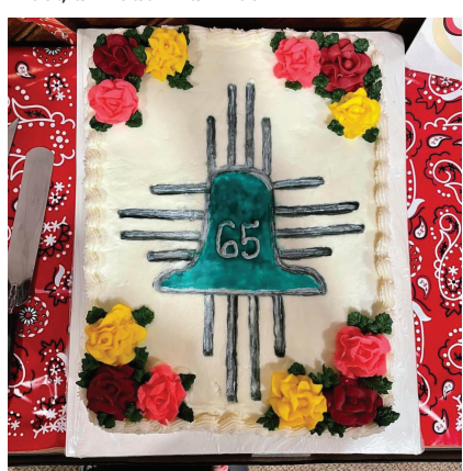
NMCB celebrated their 65th anniversary during the meeting in Ruidoso, NM.